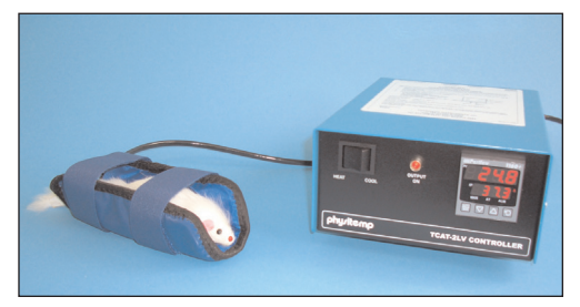
TCAT-2LV with WB-1 animal warming blanket